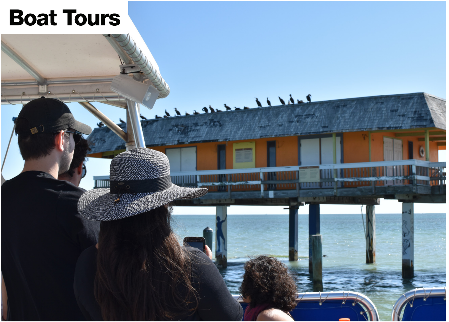
Stiltsville & Key Biscayne Cruise.