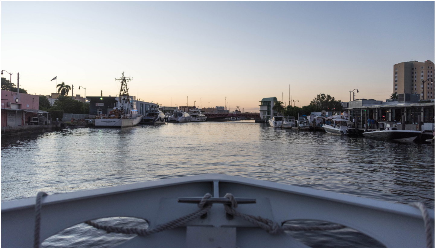
The Miami River at dusk.

For reservations, please complete our Private City Tours Booking Form at least four weeks prior to your preferred tour date. You will receive an email confirming your reservation and a custom tour proposal. For cancellations, changes to your reservation, or additional information, contact City Tours at citytours@historymiami.org or call 305-375-1621.