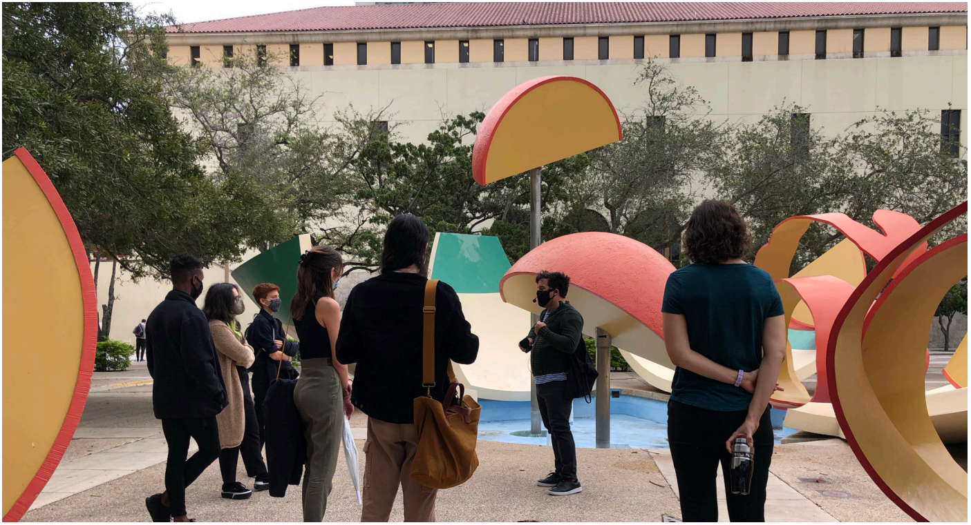
Public Art in Downtown Miami Walking Tour. HistoryMiami Museum.