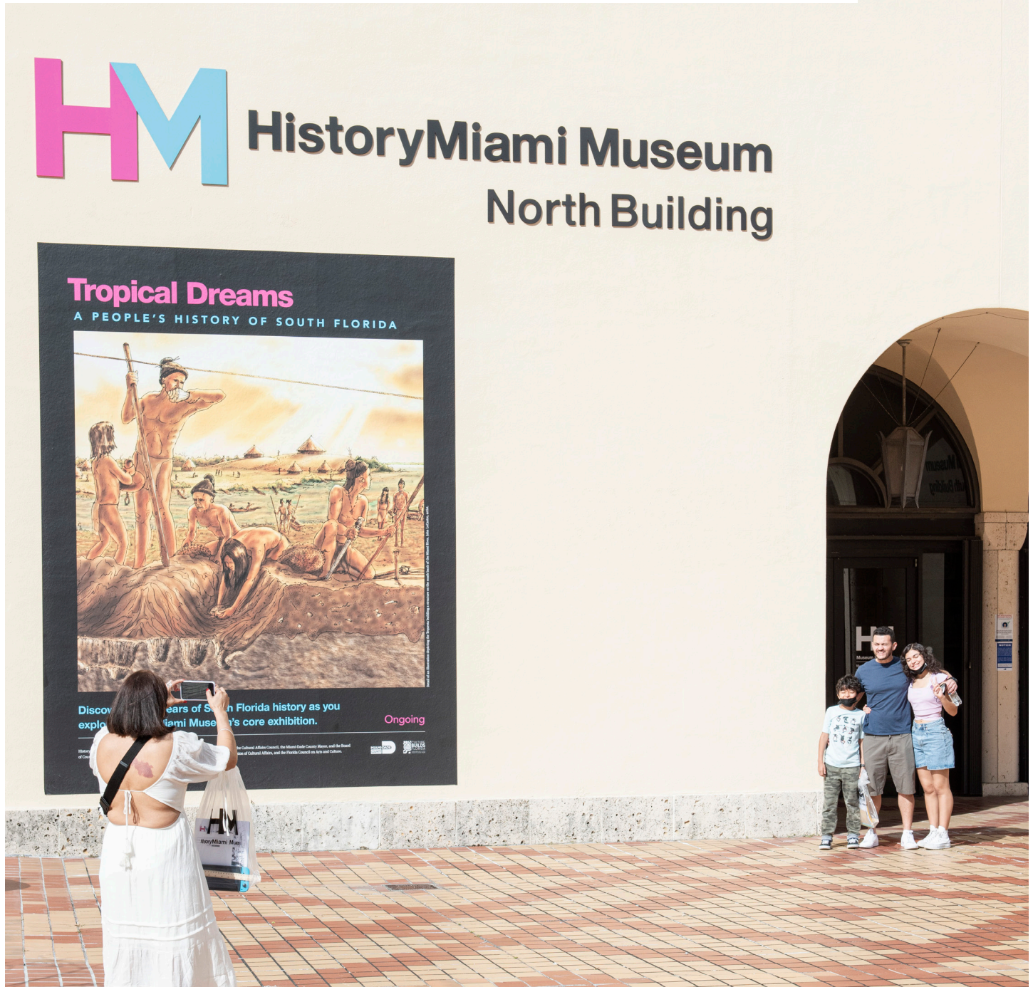
Entrance of the HistoryMiami Museum North Building.

HistoryMiami Museum, a Smithsonian Affiliate located in downtown Miami, safeguards and shares Miami stories to foster learning, inspire a sense of place, and cultivate an engaged community. Through exhibitions, artistic endeavors, city tours, education, research, collections and publications, HistoryMiami Museum works to help everyone understand the importance of the past in shaping Miami's future. HistoryMiami Museum connects people by telling the stories of Miami's communities, individuals, places, and events.