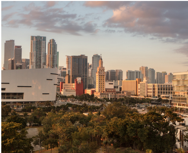
Downtown Miami.