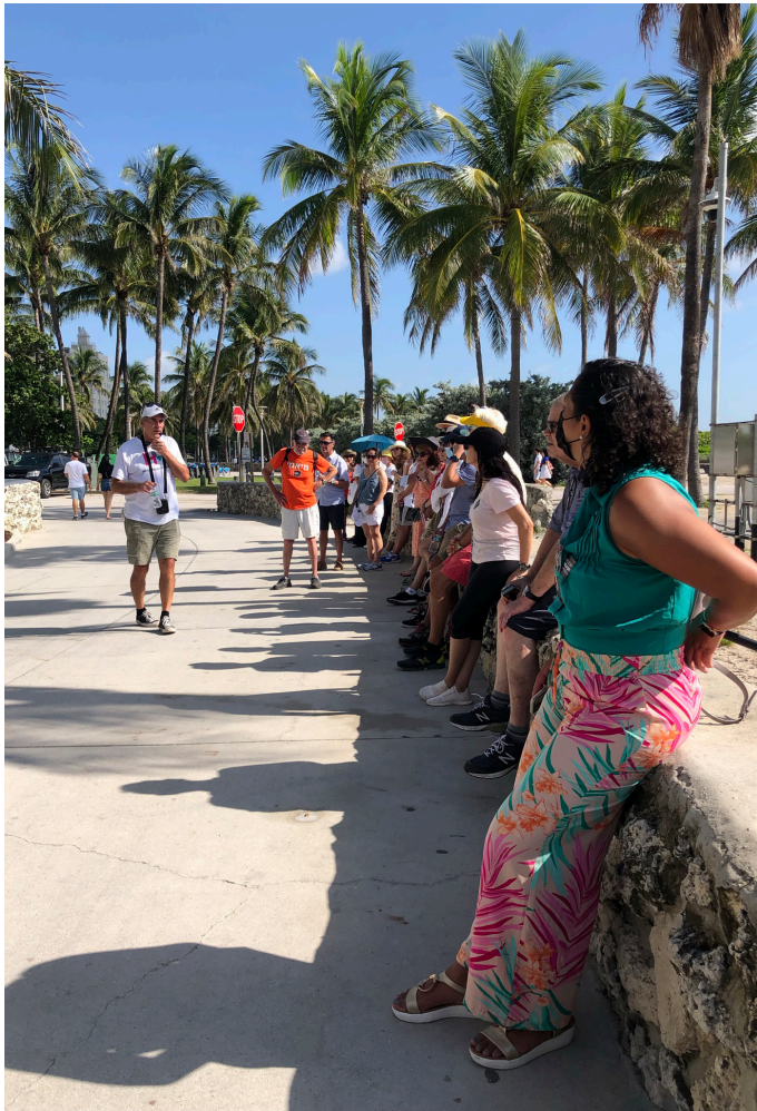
City Tours in South Beach’s Art Deco District. HistoryMiami Museum.