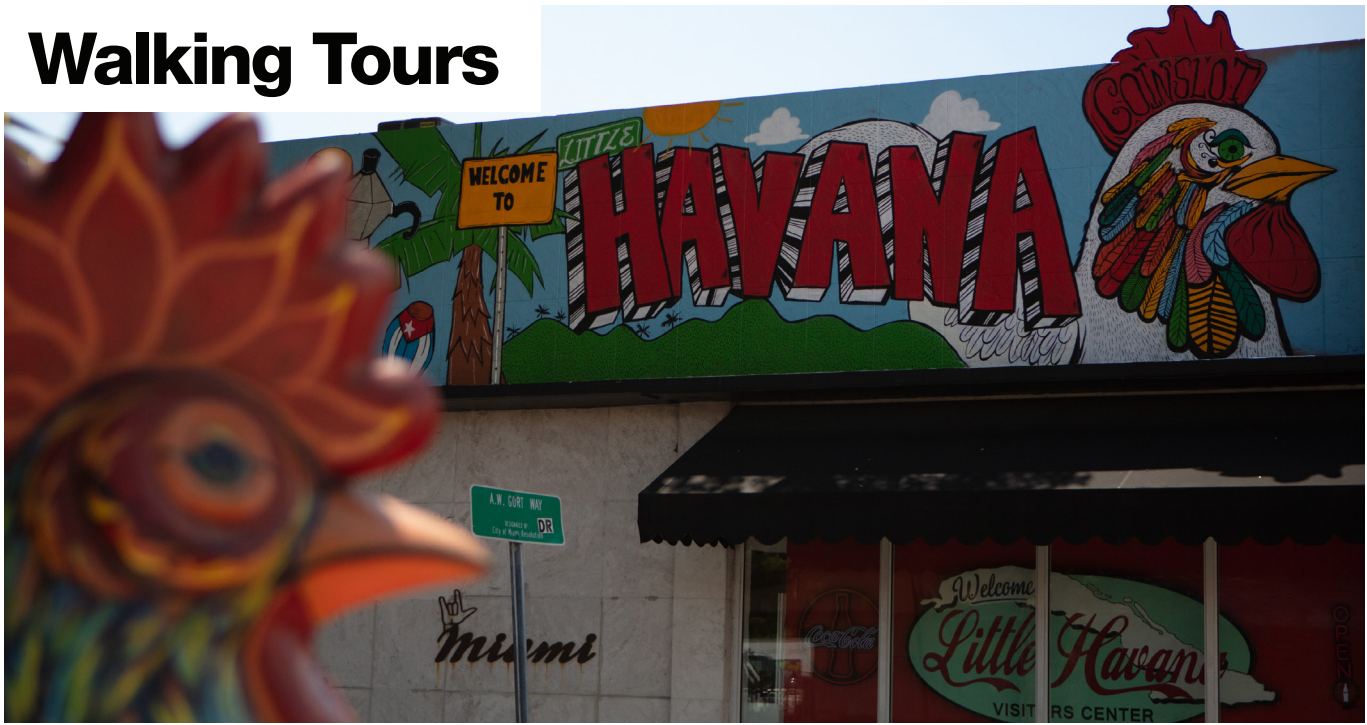
Little Havana Visitor Center.