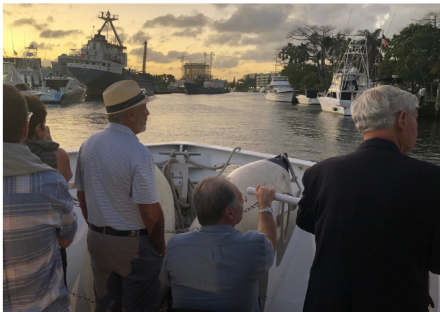
Moon Over Miami River Cruise. HistoryMiami Museum.