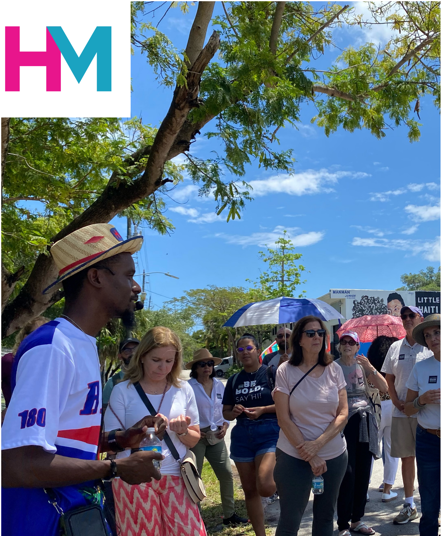
City Tours guide leads walking tour of Little Haiti. HistoryMiami Museum.