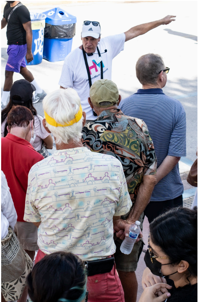
South Beach Walking Tour. FotoNoggin.

Additional walking tour routes available upon request. Pricing available upon request.