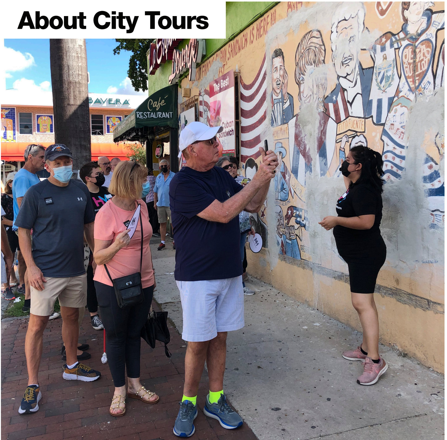
City Tours guide speaks in front of mural in Little Havana neighborhood.

Delve into the past and experience the sights, sounds and cultures of South Florida with HistoryMiami Museum's City Tours! HistoryMiami Museum offers educational tour opportunities for adults and students of all ages to learn more about the history of the region. We look forward to welcoming you on a memorable journey of our region's history as we explore the many historic neighborhoods, landmarks, and sites throughout South Florida. Our private City Tours feature walking, boat, coach, and virtual tour experiences with our HistoryMiami Museum tour guides and resident historian who are prepared to share their expertise on various topics related to Miami and South Florida history and culture. Private Tours may be customized to meet your group's individual needs.