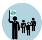
Tour Waiting Area

HistoryMiami Museum will be recognized as an autism-friendly partner by the University of Miami-Nova Southeastern University Center for Autism & Related Disabilities (UM-NSU CARD) during our March Sensory Sunday! Join us out on our museum plaza at 10:00 am for the ceremony.